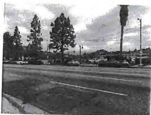
Vermont Marathon.JPG 3117K